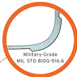
Military-Grade MIL STD 810G-516.6